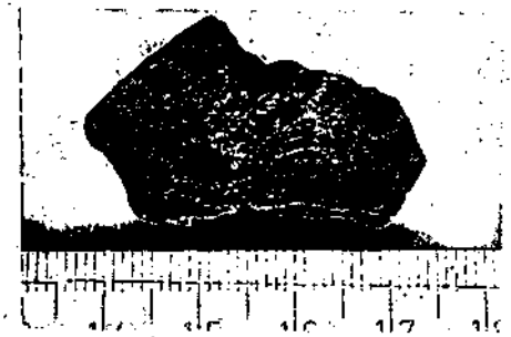
Fragment from UFO in Finland

The fragment was 36 millimeters long before it was cut up for studies. It was 6 millimeters thick, weighed 15 grams, and had a density of 4 kg/dm 3 . The fragment was not radioactive, but it was magnetic. There were five layers of material. In the middle there was a 2.5 millimeter thick layer of light-colored metallic iron. On both sides of the middle layer there were dark grey layers and 0.5 millimeter thick light grey layers. The thickness of the layers varied.