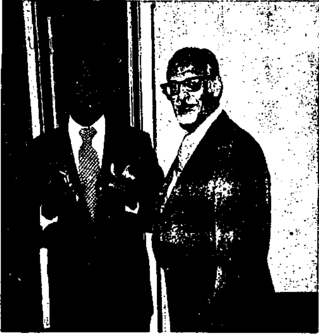
Prime Minister Gairy (l) and Len Stringfield (r) following press conference, November 30, at Park Plaza Hotel, New York City.

In November 1977 (as reported in MUFON UFO Journal No. 120), Len Stringfield played an advisory role at the United Nations on behalf of Grenada. Len has provided these photographs of the historic occasion.