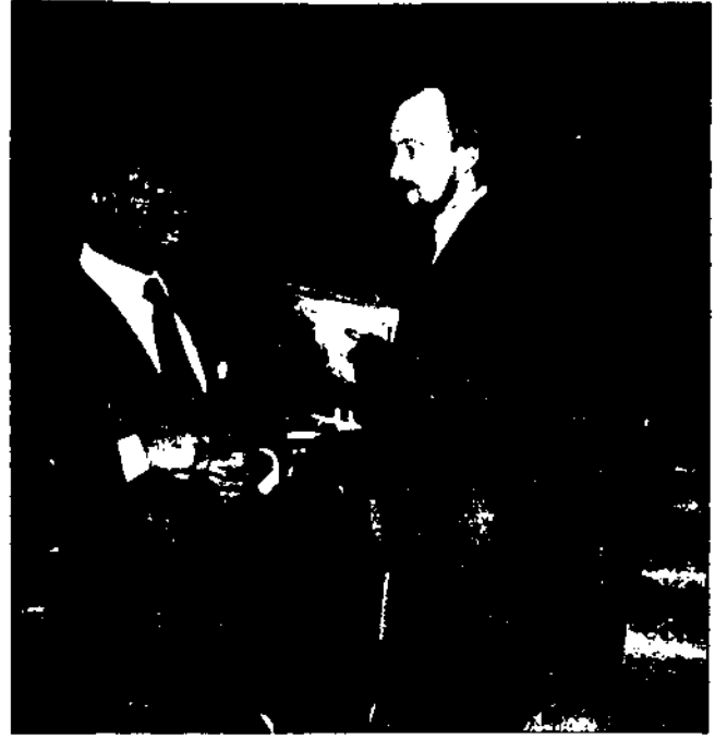
Prime Minister Gairy talks with unidentified ambassador on UN assembly floor following Dr. Friday's major, hour-long address on UFOs. Contrary to press reports, Gairy and Friday received many congratulatory handshakes.