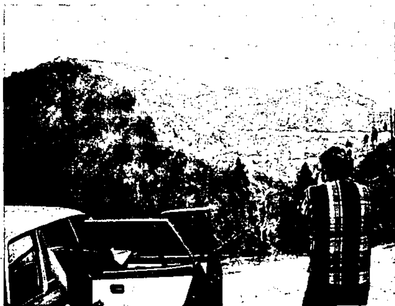
Tom Gates photographing mountain and area where he and Paul Cerny observed UFO.

(Editor's Note: As a means of identifying the rugged mountainous terrain and locale for these events, Happy Camp, California, is a small fishing resort town (population 700) on State highway 96 in Siskiyou County. It is nestled in the Salmon Mountains on the Klamath River in northern California near the Oregon State line.)